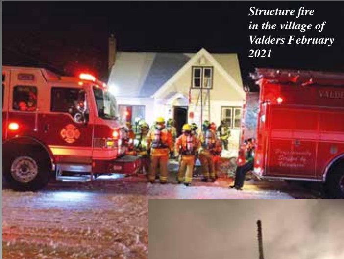
Structure fire in the village of Valders February 2021