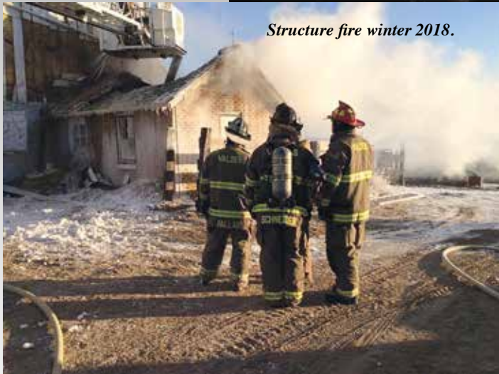
Structure fire winter 2018.