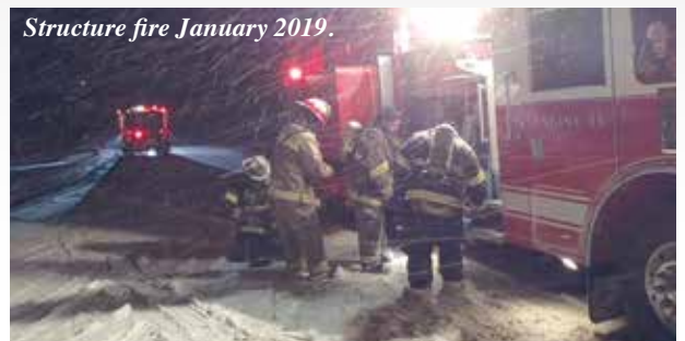
Structure fire January 2019.