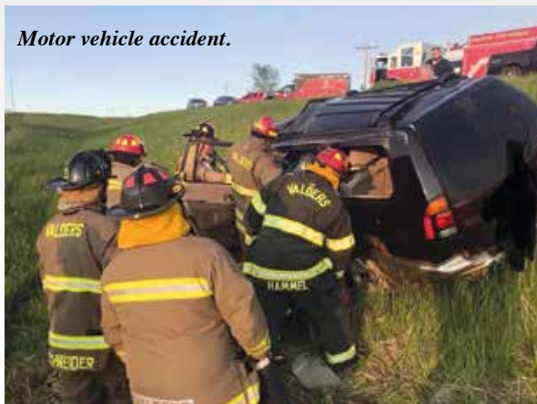
Motor vehicle accident.