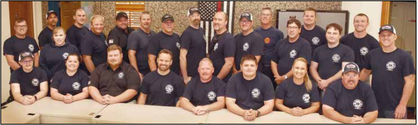
Valders Fire Department has upwards of 43 dedicated firefighters and cross trained ambulance service personnel.

department also houses the Manitowoc County Communications Unit for long duration or complicated calls. But as you take a walk around the station, you can tell that the pride and joy of their fleet is with their 1931 Knot Fire Truck. It may no longer have a water tank on board, but it has been restored and is a show piece in the parades in town.