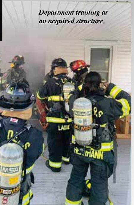
Department training at an acquired structure.